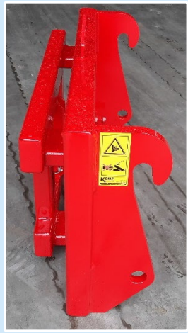
(ADAPT) Attachment > Attachment

Adapter from any attachment to another attachment of your choice.